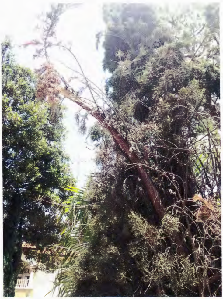
Upon closer inspection, a few of the trees sustained noticeable damage, which even if not significantly impairing long-term health, definitely affects the site's aesthetic value. But there's more at play here than mere aesthetics.

crews don't want to rent my property as a shooting location," the client explained.