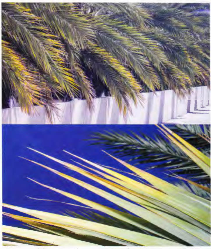
Magnesium deficiency on Phoenix dactylifera fronds appears as chlorotic (yellow) marginal banding.

Need more Dendro? Need more CEUs? Go to the ISA webstore (www.isa-arbor.com/store) and search "Detective Dendro Podcasts."