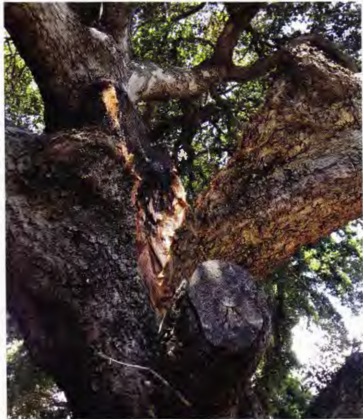
The point of failure. The younger stem wrapped around the main stem to the east, concealing a significant portion of included bark.

"Well, look at that!" I mused, rationalizing Codit's head just happened to locate it. "It looks like you found a clue! And I think it may change my conclusion for this case, too."