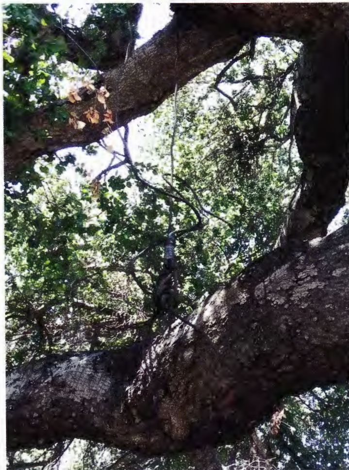
The old cabling system that whacked Codit's helmet! The rust on the cable indicates it should have been inspected and replaced many years ago.

I chuckled to myself, placing my gear in the back of the truck and then hopping into the diver's seat. "You