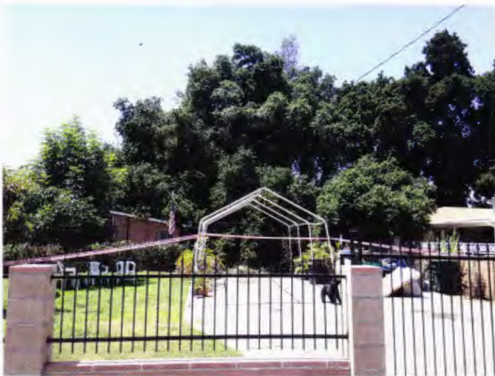
Looking south (from the street) at the failed tree. A large lateral branch crushed the garage (center) and lay across the main house and the neighboring house (right).

I got on a ladder to look at the failure point on the eastern side of the main stem. Upon closer examination of the wound, I saw that the lateral stem did not originally emerge from the eastern side of the main stem, as initially thought. Long ago, the subject branch emerged at a narrow angle of attachment on the southern side of the main trunk and wrapped its way around the stem towards the east. Over time, the lateral stem increased in size and